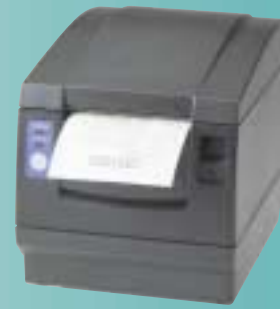
black case model